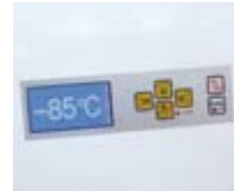
Digital Controller with micro processor and battery backup.